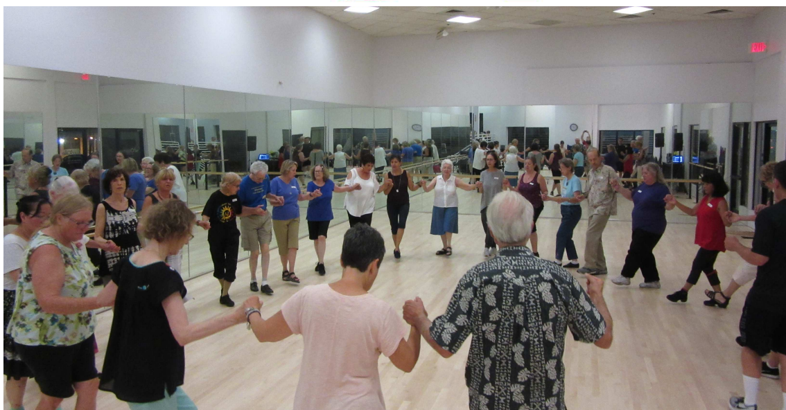
Our First Saturday Night at Oasis